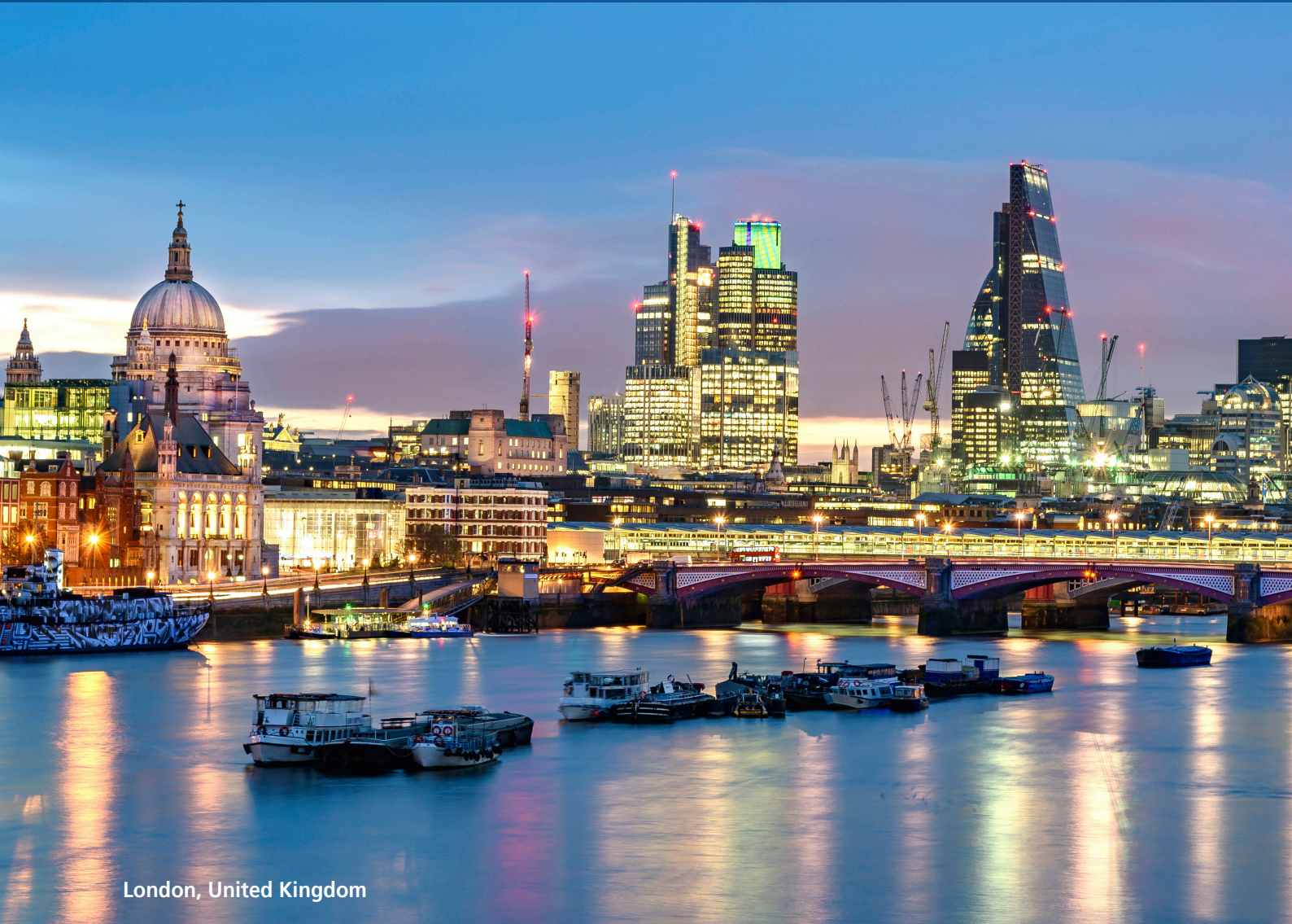
London, United Kingdom