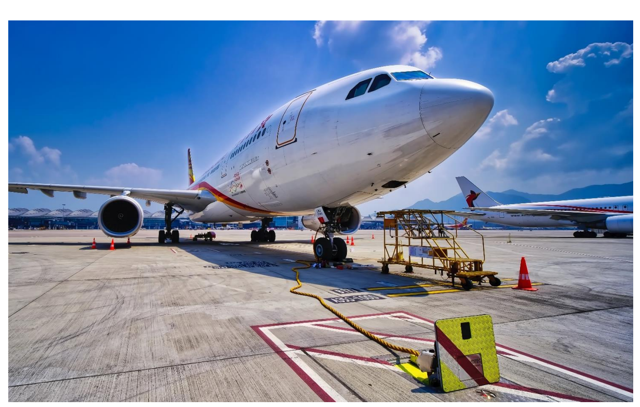
Cavotec Hatch Pit in-ground system supplying 400Hz power to an aircraft at Hong Kong International Airport.

The Board of Directors' proposal to the Annual General Meeting is that no dividend is to be paid for the 2019 financial year.